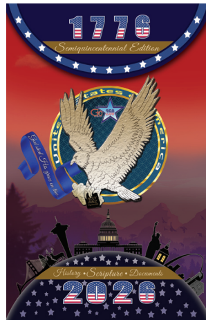
Go 250 Commemorative Booklet Cover

For over 70 years, The Voice has been committed to Fundamental Christianity and American Freedoms. We commit to you to move forward on the foundations that have been laid before us. Thank you for your commitment of prayer and financial support for this ministry.