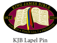
KJB Lapel Pin

What version is right for me? - Study brochure on the King James Bible King James Bible Translators Card Set - learn the history and biographies of translators; Bible memory Constitution Card Set - Learn key aspects of all seven articles of the Constitution and the Amendments